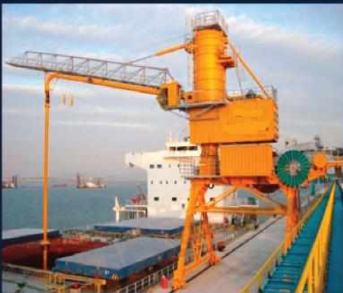
PNEUMATIC SHIP UN LOADER