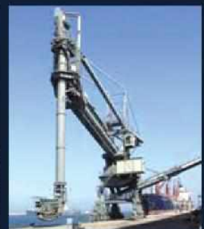
STORAGE SILOS AND MECHANICAL UNLOADING SYSTEM